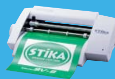
Model SV-8 160mm (8") Cutter