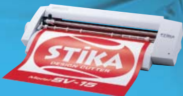
Model SV-15 340mm (15") Cutter

Create Colorful Custom Graphics with Ease